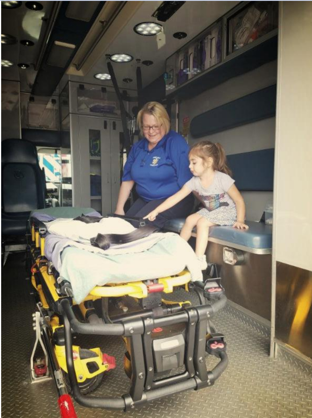
Walmart Safety Event - Osage Beach Ambulance